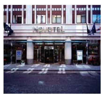
Land Securities , Accor Portfolio UK 29 Novotel and Ibis Hotels Role: Professional Advice - Valuation