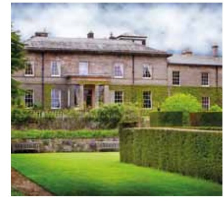
Doxford Hall, Northumberland 31 bedrooms Role: Selling Agent - Going Concern