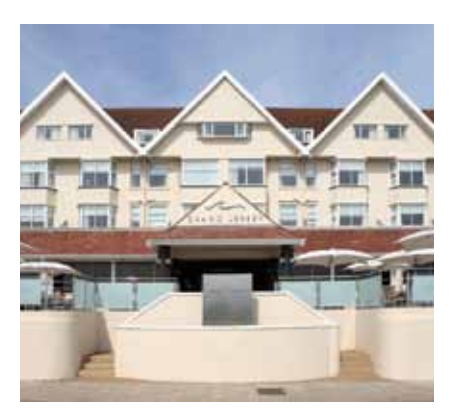
Grand Jersey, Hotel and Spa, Jersey 122 bedrooms Role: Selling Agent - Going Concern