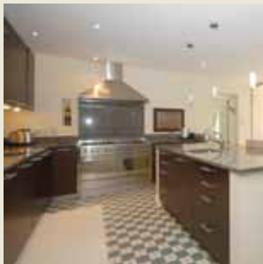
Far left Ryders Terrace, St. John's Wood NW8