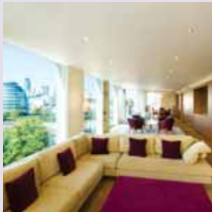
Left Crown Apartments, Shad Thames SE1