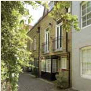
Left Lyndhurst Road, Hampstead NW3

CAN KNIGHT FRANK OFFER ME PROPERTIES ANYWHERE IN LONDON?