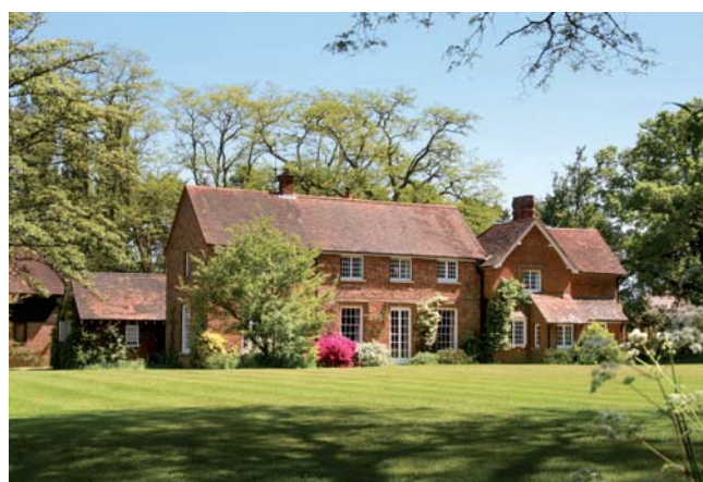
THE OLD SCHOOL HOUSE

whom have entrusted Knight Frank with the sale of their beloved homes and have moved to other parts of the country. The connection with the same family doesn't stop there. Our Winchester office is presently selling a large house owned by the same family in Hampshire. Loyalty indeed!